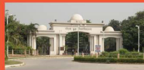
GAUTAM BUDDHA UNIVERSITY