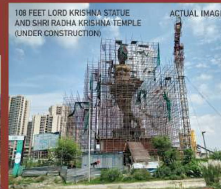
108 FEET LORD KRISHNA STATUE AND SHRI RADHA KRISHNA TEMPLE (UNDER CONSTRUCTION) ACTUAL IMAGE

Gaur Yamuna City offers Plots, Apartments, Retail Shops, Studio Apartments, Themed Villas, Sports and a lot more.