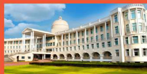
NOIDA INTERNATIONAL UNIVERSITY