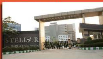
IT PARK & MNC'S