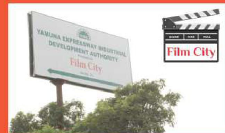
SITE FOR FILM CITY