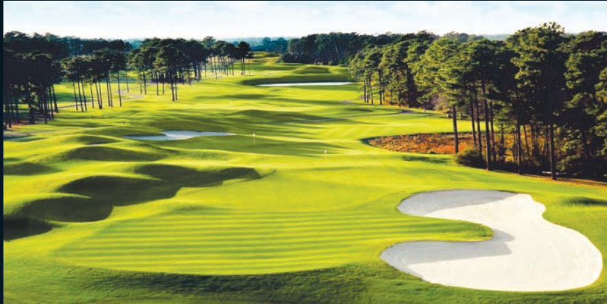
9 HOLE ORGANIC GOLF COURSE