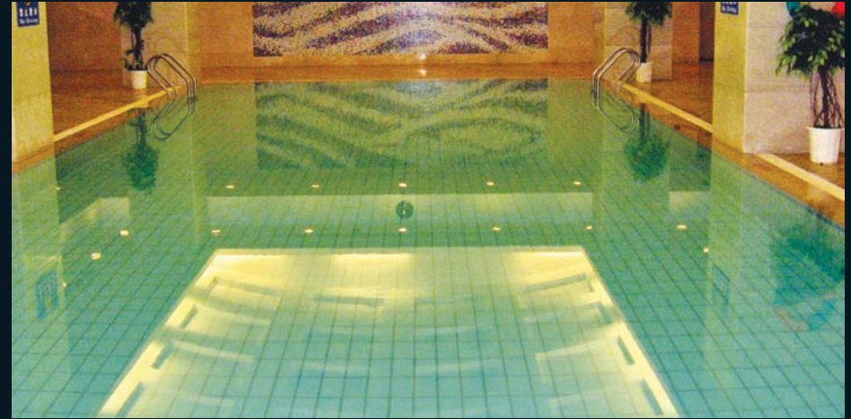
INDOOR HEATED POOL