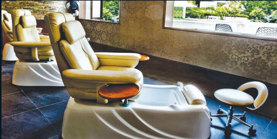
SPA & SALON BY WARREN TRICOMI