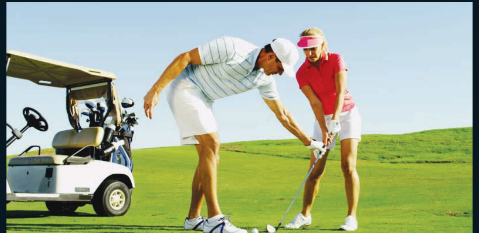
GOLF ACADEMY BY GOLFING NATION