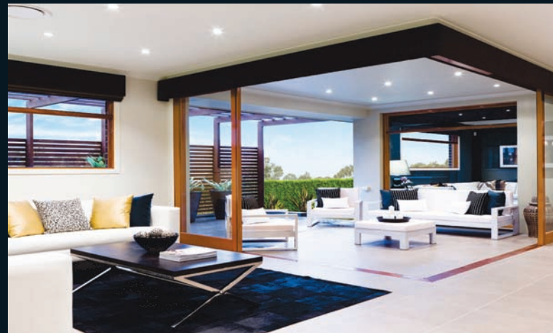
AIR CONDITIONED VILLAS