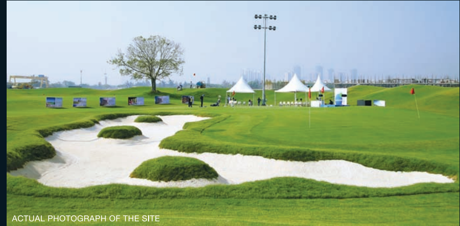
ACTUAL PHOTOGRAPH OF THE SITE