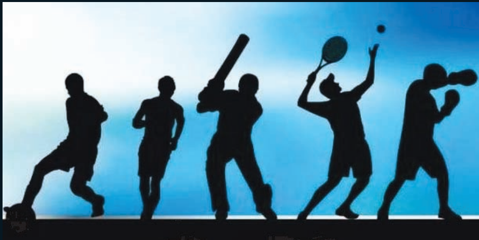
SPORTS ACADEMY BY TENVIC