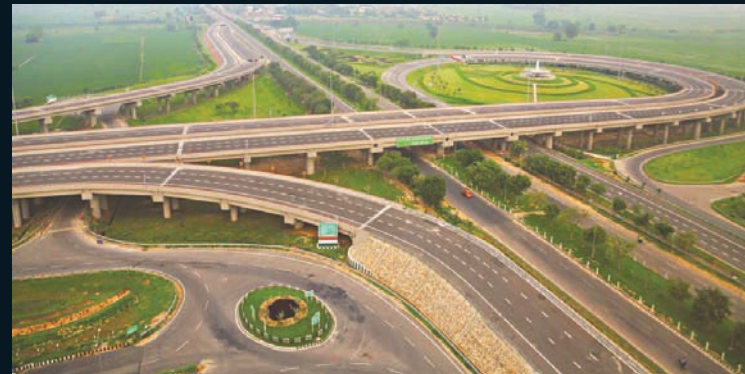
CONNECTED WITH 3 MAJOR EXPRESSWAYS TAJ EX, NOIDA-GR NOIDA EX, FNG EX