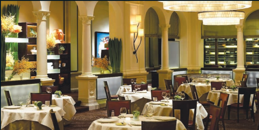
FINE DINING RESTAURANT