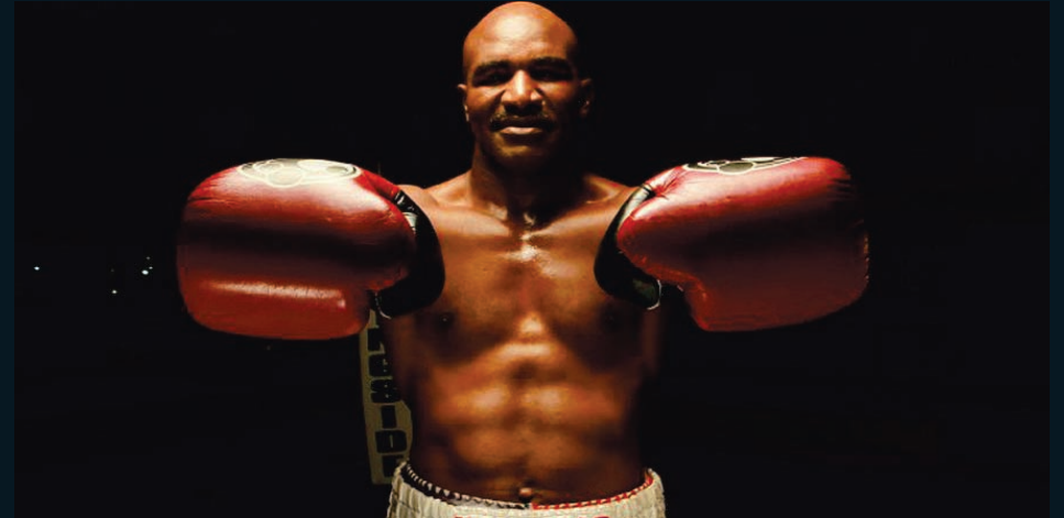
GYMNASIUM BY HOLYFIELD GYMS