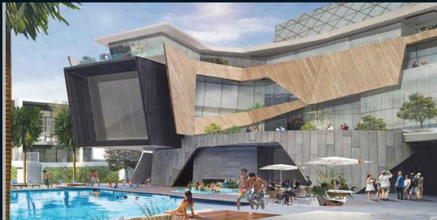
EXPANSIVE GOLF CLUB