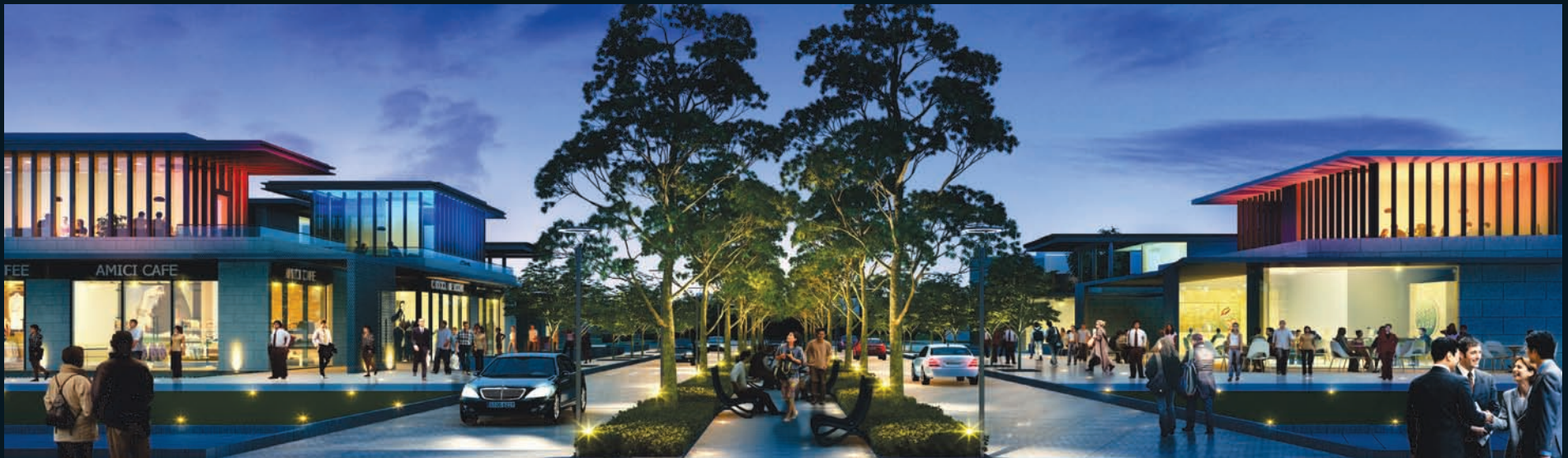
HIGH STREET RETAIL