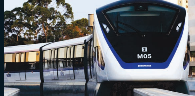
CLOSE PROXIMITY FROM DELTA I - METRO STATION