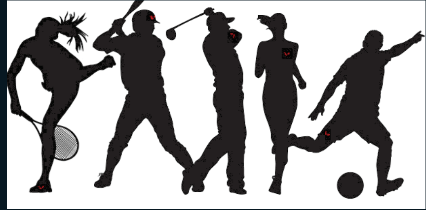
STATE-OF-THE ART SPORTS ARENA