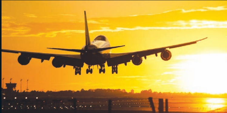
CLOSE PROXIMITY TO UPCOMING INTERNATIONAL AIRPORT