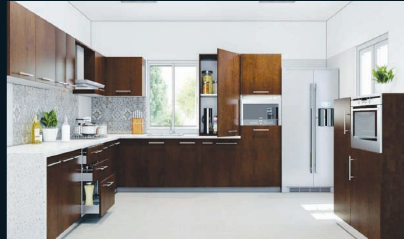
DESIGNER KITCHEN WITH BUILT IN APPLIANCES