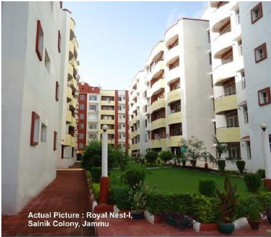
Actual Picture : Royal Nest-I, Sainik Colony, Jammu