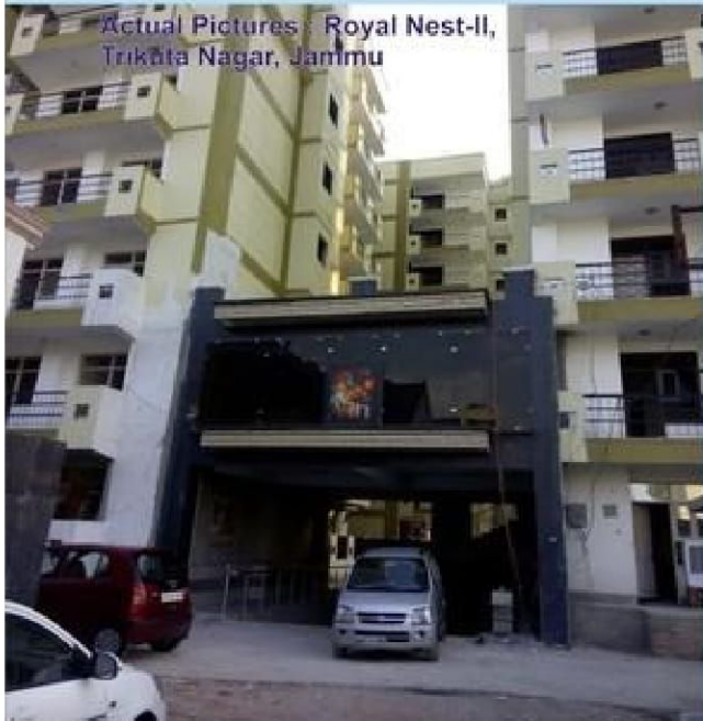
Actual Pictures : Royal Nest-II, Trikātā Nagar, Jammu