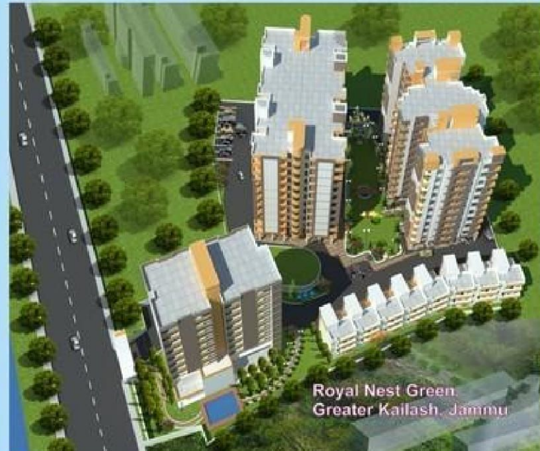
Royal Nest Green Greater Kailash, Jammu