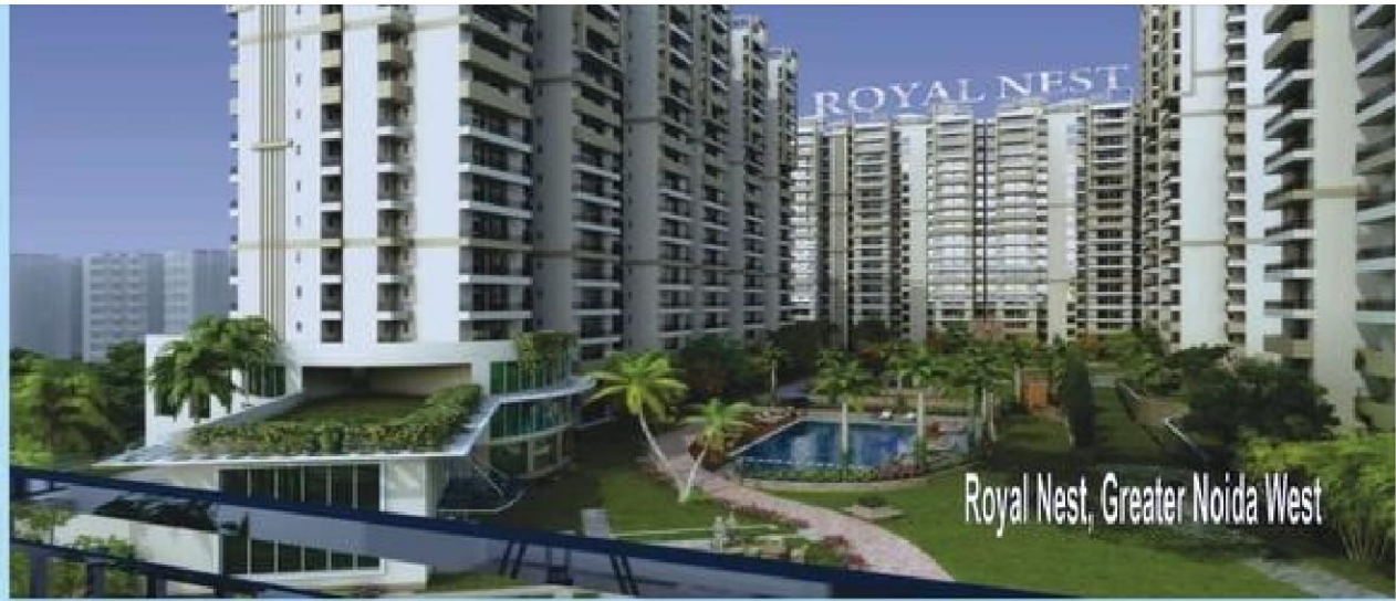
Royal Nest, Greater Noida West