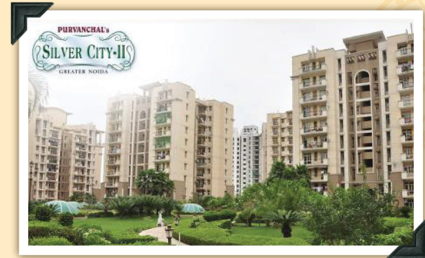
Purvanchal Silver City II (Gr. Noida)