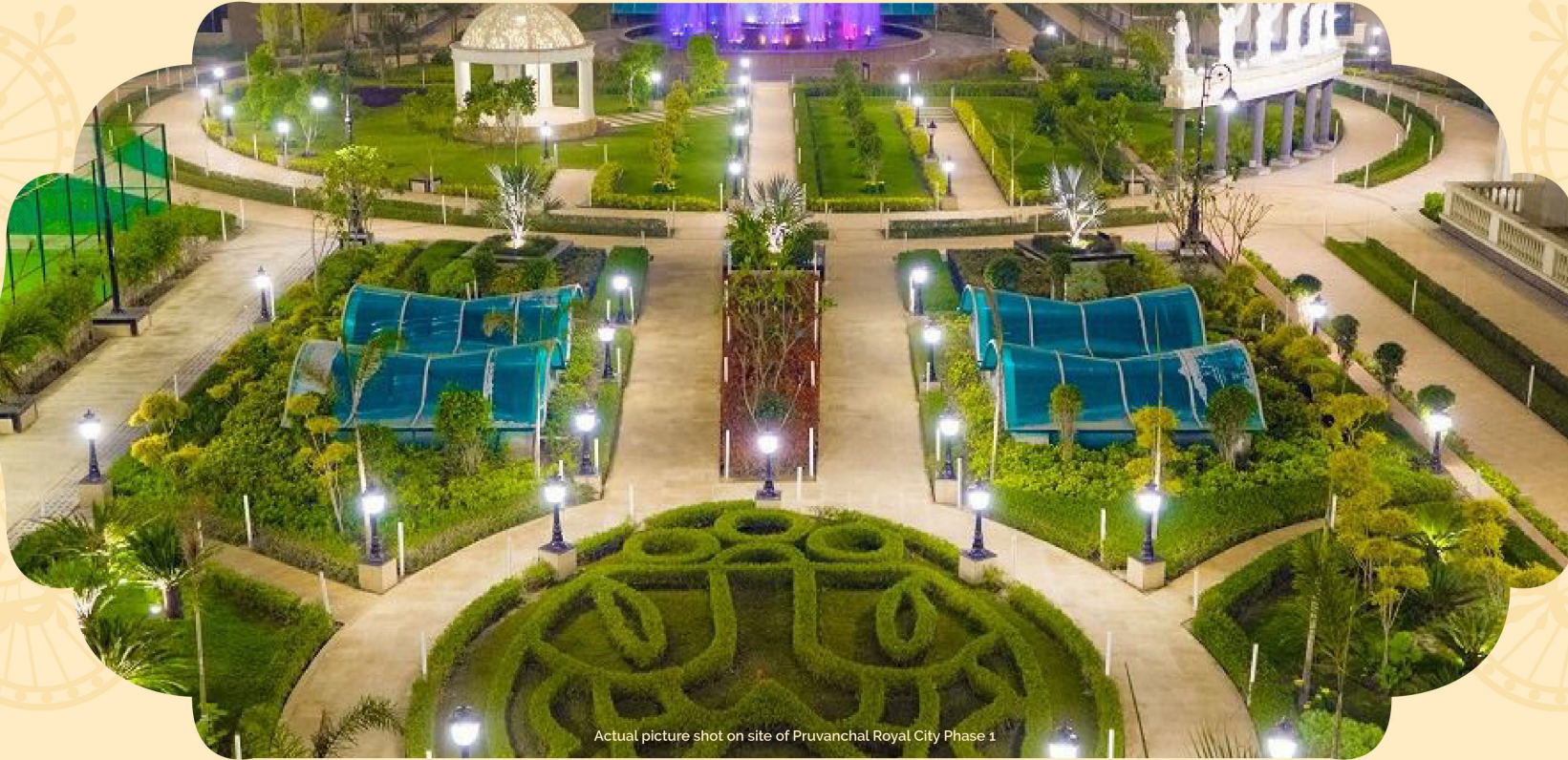
Actual picture shot on site of Pruvanchal Royal City Phase 1