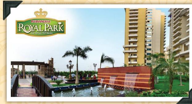
Purvanchal Royal Park (Sec-137, Noida)