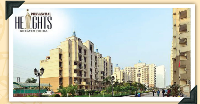
Purvanchal Heights (Gr. Noida)