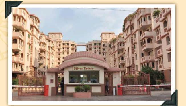
Purvanchal Silver Estate (Sec-50, Noida)