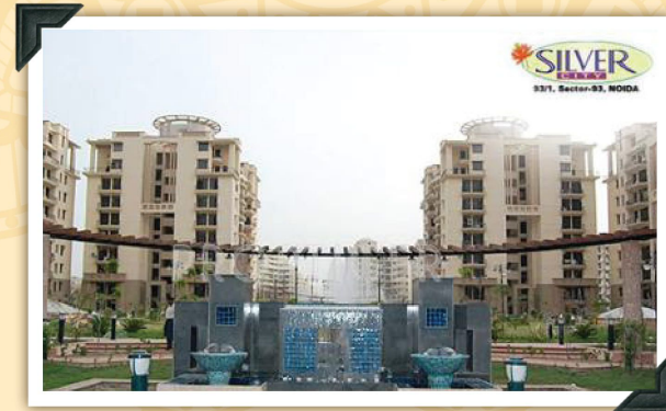
Purvanchal Silver City (Sec-93, Noida)