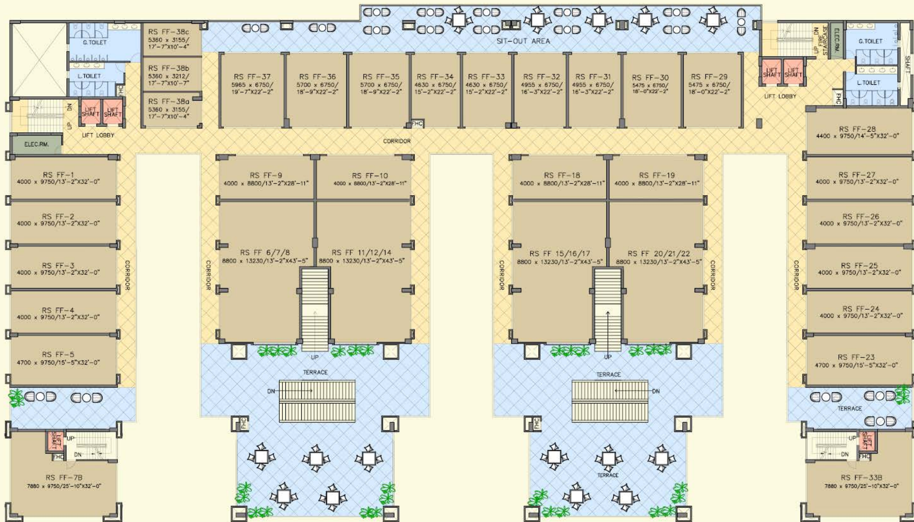
Retail First Floor Plan