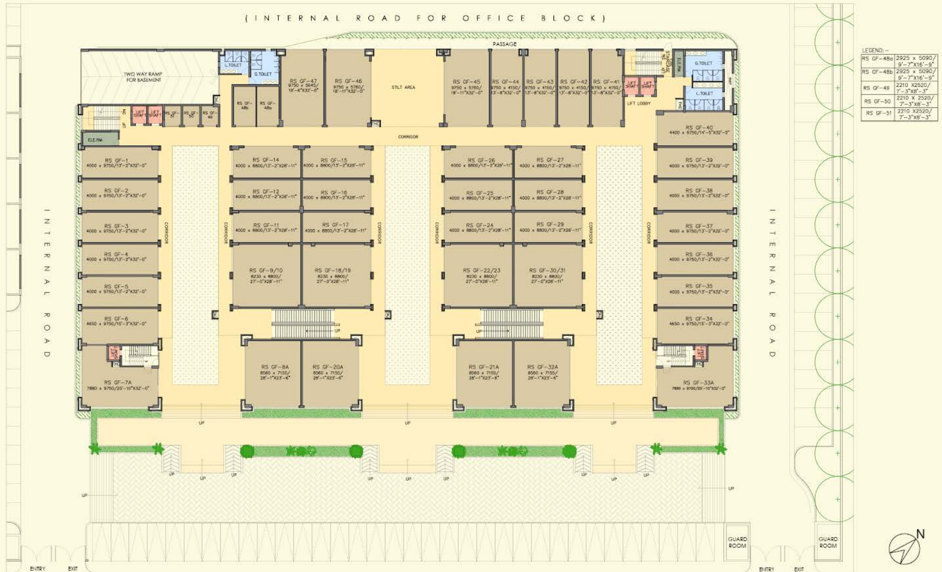
Retail Ground Floor Plan