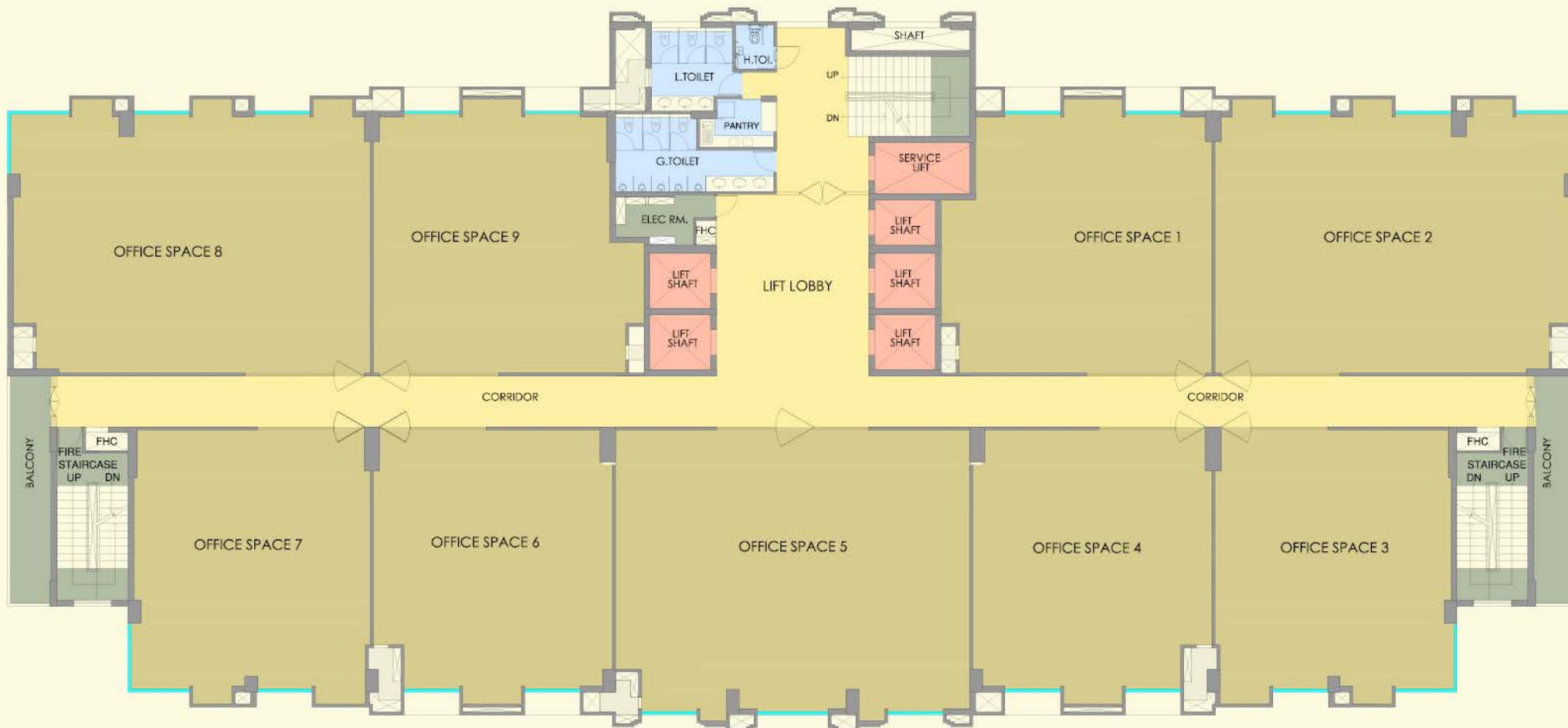
Tower-B: Typical Floor Plan