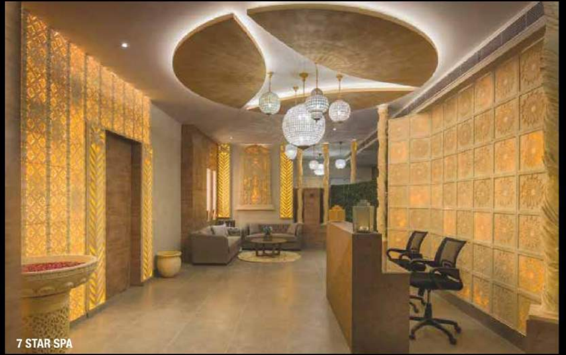
7 STAR SPA