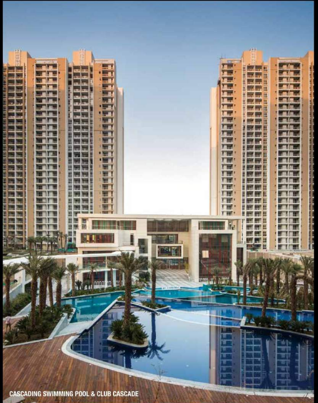
CASCADING SWIMMING POOL & CLUB CASCADE