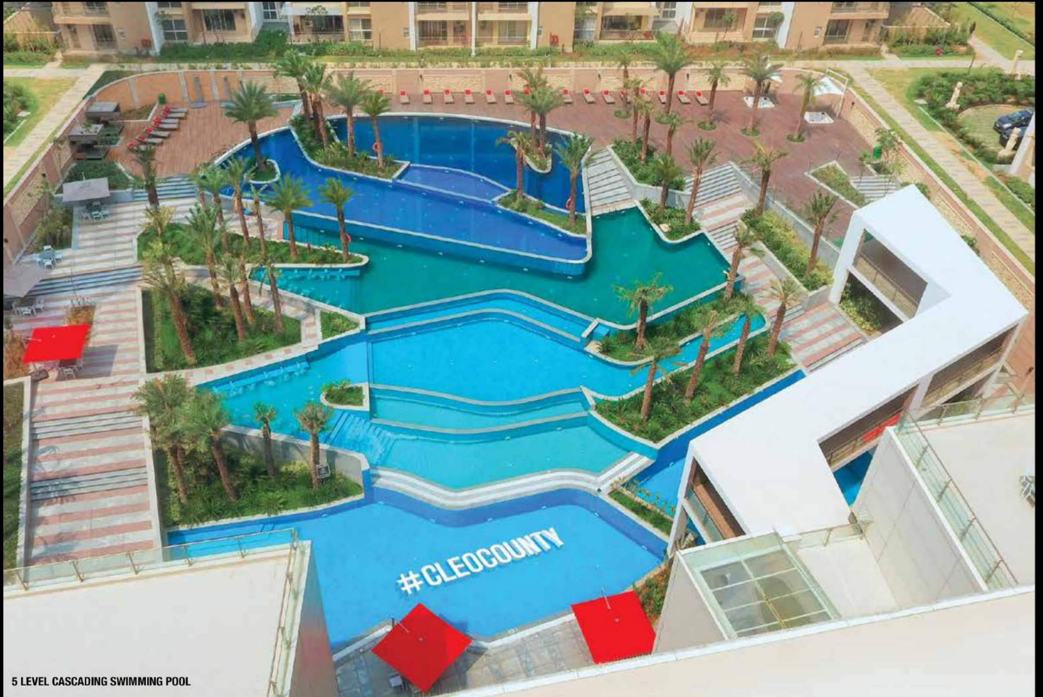
5 LEVEL CASCADING SWIMMING POOL