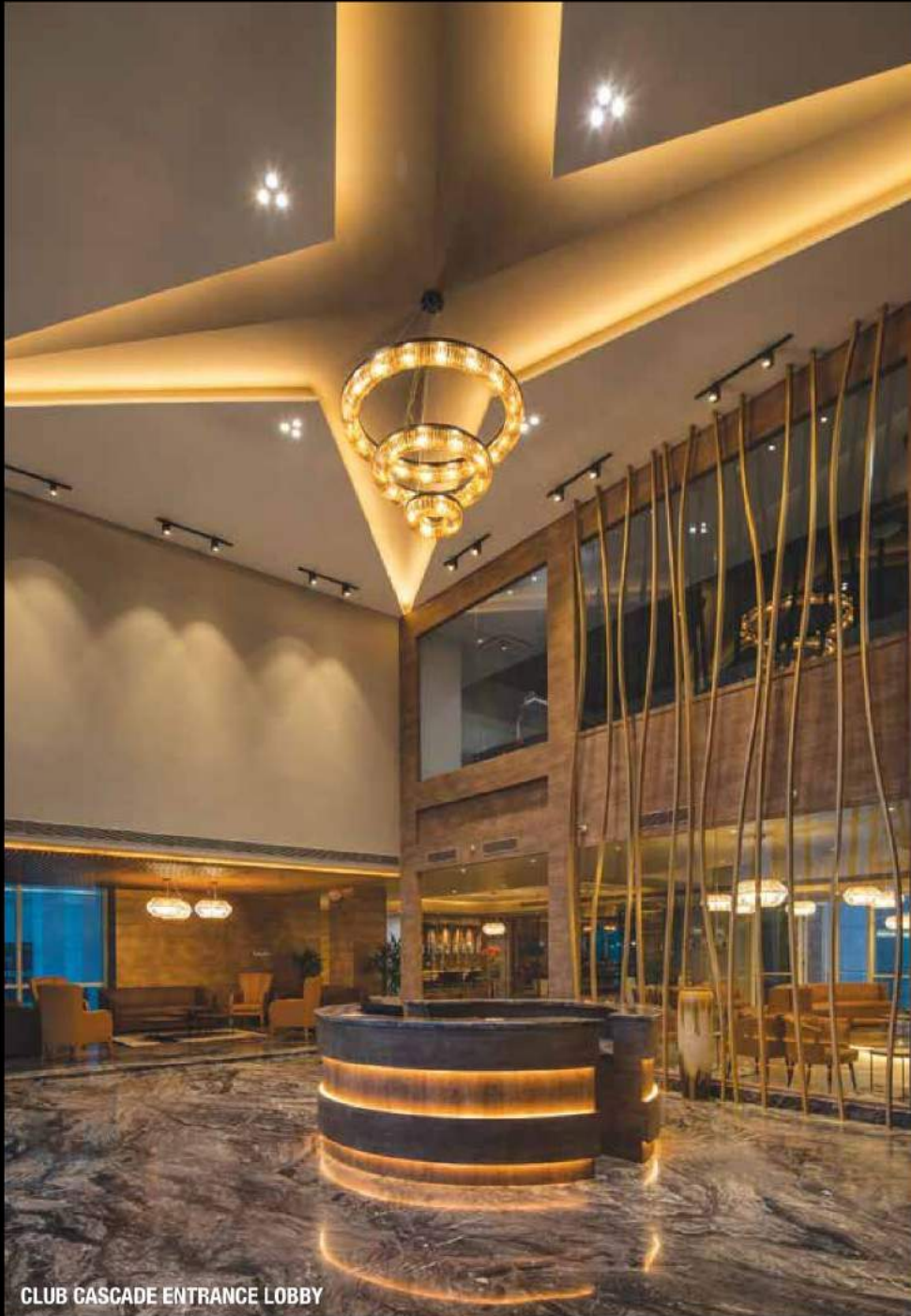
CLUB CASCADE ENTRANCE LOBBY