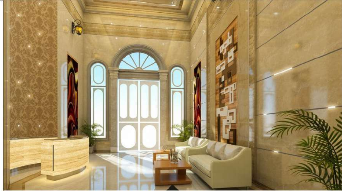
Airconditioned Entrance Lobby