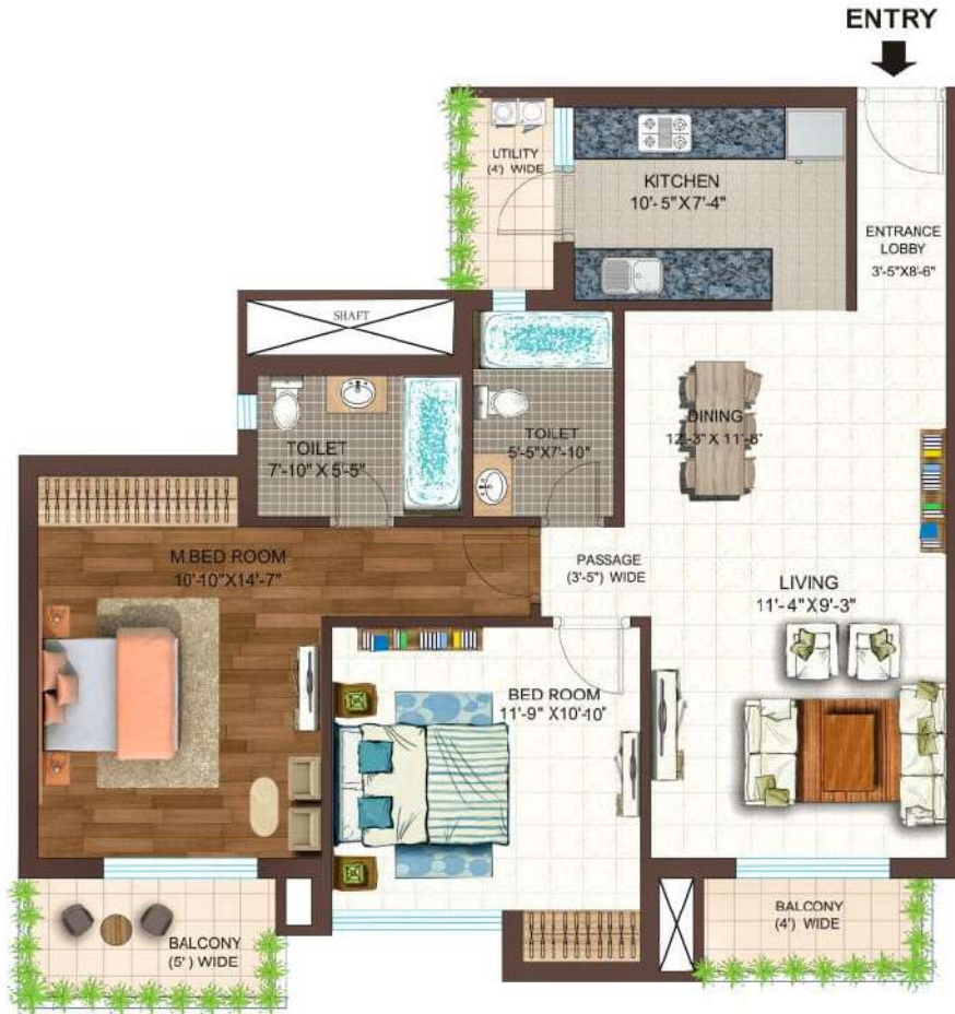
Typical Floor Unit Type-C